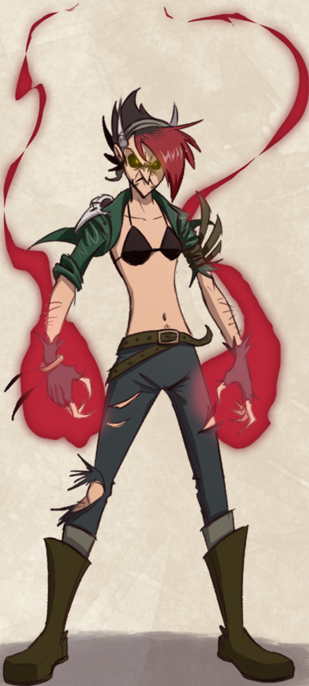
Artwork by DM Tuz

Even hagspawn are on a subconscious level allured by these heartstones, knowing deep within that they are needed to tap further into their hag nature. Legends say that these heartstones are the key for hagspawn to perform their transformation into full hags, leaving behind their humanity to ascend into their full potential. Alone, the possession of one of such stones has a huge impact on the innate abilities of a hagspawn, dramatically increasing their inherited powers.